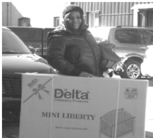
Receiving Brand New Crib

Over the years, NewThreads of Hope along with Two Tunics have supported the SOS Center with new clothing donated from local corporations and we are exceptionally grateful. The fall of 2010 brought us a once in a lifetime blessing through NewThreads of Hope and the Juvenile Products Manufacturers Association (JPMA). During September, JPMA embarked on a five city education and sleep product donation tour in which Milwaukee was included. In an effort to address the co-sleeping issues in Milwaukee, JPMA donated to NewThreads of Hope brand new cribs, portable play yards, wearable infant blankets, HALO Sleep Sacks and onesies from the "This Side Up" campaign. The SOS Center was fortunate to in turn receive some of these items for our families. This coincided perfectly with our