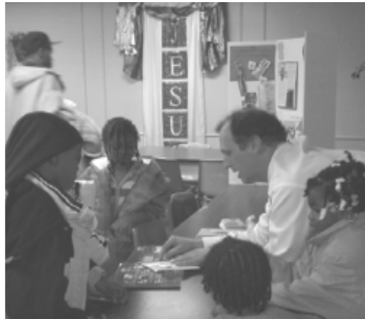
Kids learning about Dental Health

The Concordia University Nurse Practitioner students once again put on a Health Fair at the SOS Center on October 22, 2010. It was held in conjunction with the Center's Annual Coat and Blanket Drive. The Nurses had booths on cholesterol, hygiene, asthma, diet, blood pressure, diabetes, car seat safety, crib safety and eye exams among other topics. They also provided healthy snacks and lunch. Thank you to everyone involved, it was a great success!