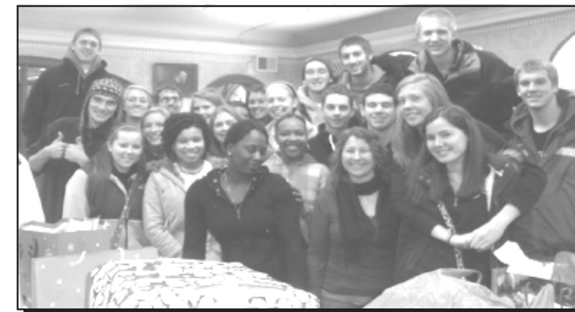
MLHS - National Honor Society Students and SOS staff