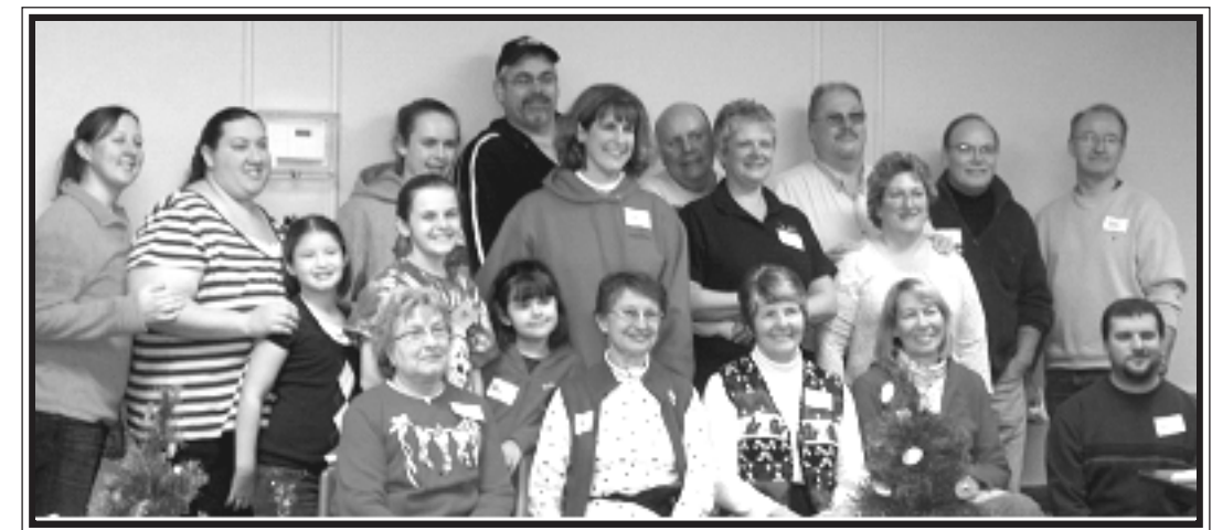
Volunteers from Hales Corner Lutheran Church